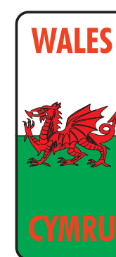
Ref: 7 Positive